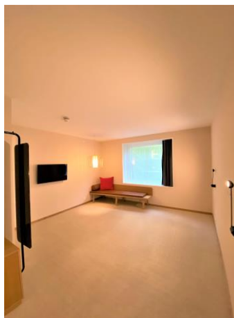
Sample room, unfurnished