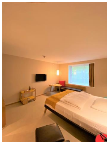
Sample room, furnished